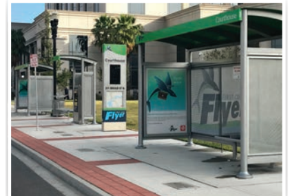
Completely customizable BRT solutions with digital information kiosks