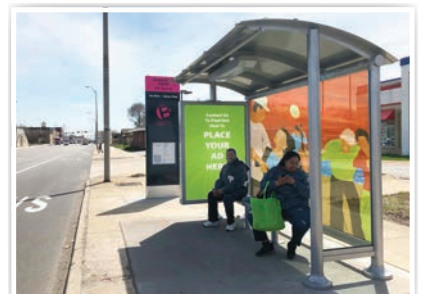
10-ft totem-style route-branded kiosk and transit shelter featuring public art rear wall