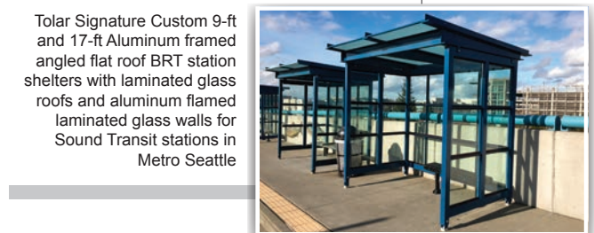
Tolar Signature Custom 9-ft and 17-ft Aluminum framed angled flat roof BRT station shelters with laminated glass roofs and aluminum flamed laminated glass walls for Sound Transit stations in Metro Seattle

These styles are representative of product options within this series. VISIT WWW.TOLARMFG.COM FOR ADDITIONAL IDEAS, OPTIONS AND SPECIFICATIONS