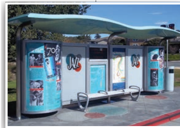
22-ft Tolar Signature BRT Transit Shelter Solution for Monterey Salinas Transit's JAZZ BRT Featuring a fiberglass roof with stainless steel supports, integrated map display, custom glass and bull nose display kiosk