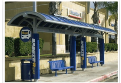
Agency branding with custom columns and signaling beacon