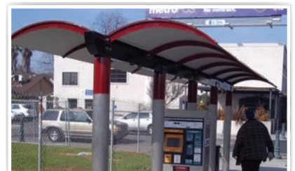
Gull Wing roof is available arched or angled (pictured: arched)

Our BRT/Rail Series works in concert with communities focused on streamlining their transit systems through bus rapid transit and rail services. The sleek lines and modern twist on traditional bus shelters results in a BRT/Rail shelter that creates a stylish Sense of Place™ for fast-paced metropolitan cities. And with options like solar-power, smart device connectivity and digital advertising/information displays, your community will appreciate your commitment to innovation.