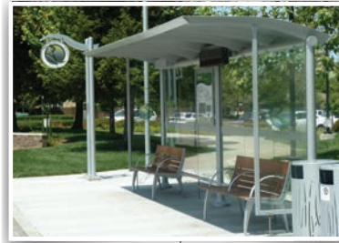
12-ft Tolar Signature BRT Solution for Tri-Valley Rapid in Livermore, CA featuring custom agency branded glass, real time information and integrated map case

CREATING BUS SHELTERS AND OTHER OUTDOOR STRUCTURES OF DURABILITY AND DISTINCTION THAT REFLECT THE CHARACTER OF YOUR COMMUNITY . . . THAT'S THE TOLAR DIFFERENCE.