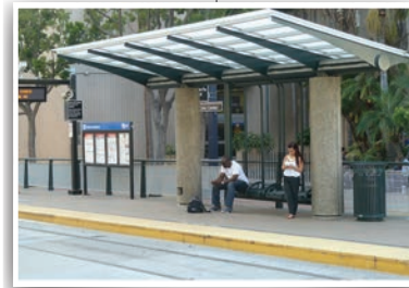
Custom trolley shelters featuring all steel construction, custom roof panels, custom lighting, and concrete post cladding