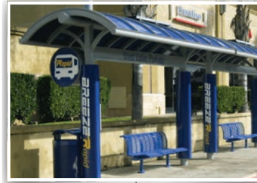
32' Tolar Signature BRT Shelter for Escondido (CA) with custom columns and a signaling beacon

CREATING BUS SHELTERS AND OTHER OUTDOOR STRUCTURES OF DURABILITY AND DISTINCTION THAT REFLECT THE CHARACTER OF YOUR COMMUNITY . . . THAT'S THE TOLAR DIFFERENCE.