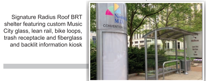
Signature Radius Roof BRT shelter featuring custom Music City glass, lean rail, bike loops, trash receptacle and fiberglass and backlit information kiosk

These styles are representative of product options within this series. VISIT WWW.TOLARMFG.COM FOR ADDITIONAL IDEAS, OPTIONS AND SPECIFICATIONS