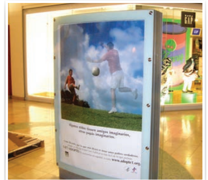
Contemporary radius advertising blade display with UL 110V backlit illumination