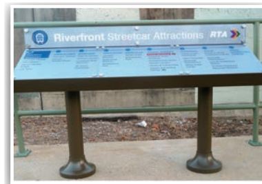
Table top information and wayfinding kiosk with custom aluminum support posts, and spun shoe covers. Shown with Braille enhancements