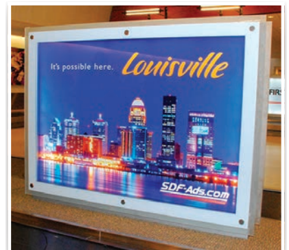
Baggage Deck Displays feature blade static double-sided dioramas

Our line of indoor and outdoor advertising displays adds dramatic visibility to your out of home advertising messages and critical directory information, whether for public transit shelter installations, lifestyle centers, airports or more. The sheer size of our displays brings life to your message! From concept to completion, our experienced team of designers, engineers and fabricators develop a product that delivers on your message while matching and enhancing the architectural aesthetics of the public space.