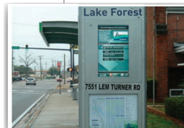
10-ft Digital Display Kiosk with custom agency branding 32" back to back LCD digital screens in a NEMA rated enclosure with back LIT LED map cases below

These styles are representative of product options within this series. VISIT WWW.TOLAR.MFG.COM FOR ADDITIONAL IDEAS, OPTIONS AND SPECIFICATIONS