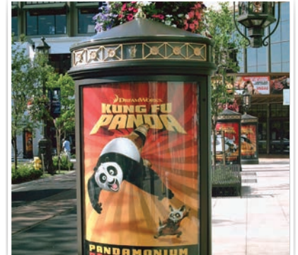
Radius Blade Kiosk featuring classical trim elements tailored to site aesthetics