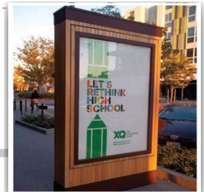
Freestanding LED backlit illuminated kiosk designed to match the local architecture