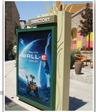
Custom blade directory display with Signature series trim. Cantilevered design allows for custom header and hidden hinge door for easy ad exchange