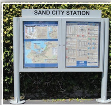
Two door, side-by-side information kiosk with location cap and LED illumination